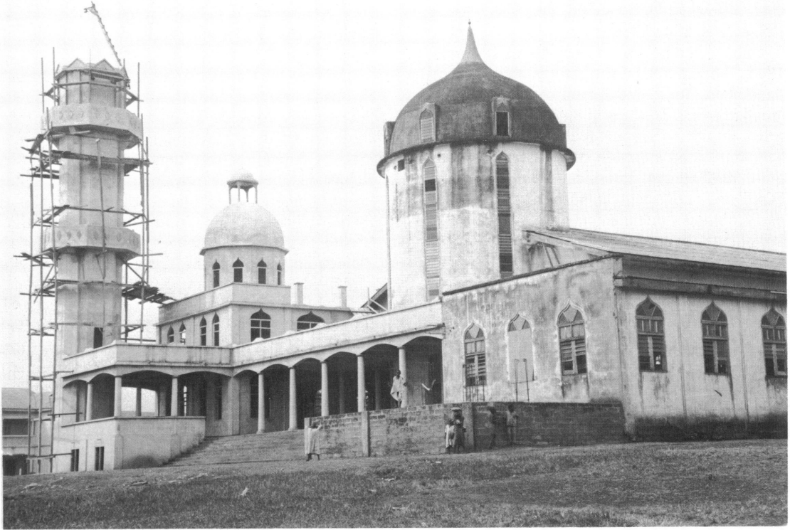
FIG. 2. The Kumasi Central Mosque under repair in 1968.

rate roles, that of Friday Imām and that of Ḥaṣa Imām, just as the political head of the Hausa community is known both as Hausa headman and as Sarkin Zongo. Even after the office of Sarkin Zongo was officially abolished the Hausa headman continued to play certain ritual roles that expressed his position as a leader of the entire Zongo. On the main Muslim festival days he leads a procession of Muslims, including the other headmen, to greet the Asantehene and the representatives of the national administration. He acts as an intermediary between the national government and the other headmen, and is often asked to arbitrate disputes between non-Hausa groups in the Zongo. Non-Hausa headmen are presented to him for recognition when they assume office even though he has no authority in their election. The Hausa Imām in his capacity as Imām al-Jum'a and the Hausa headman in his capacity as Sarkin Zongo are then symbolic