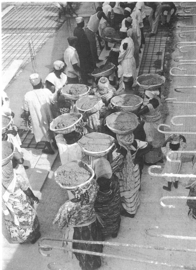
FIG. 3. Men and women from Kumasi Zongo working as volunteers to repair the Central Mosque. The work is done on Sundays, to the accompaniment of drumming.

back in the history of Asante; it goes back to the pre-colonial period, when Kumasi asserted control over the northwest, which continued right through to the post-independence period (see discussion in Austin, 1964, p. 293f; Tordoff, 1965; and Busia, 1951). Although it is difficult to claim that the Brong/Kumasi split among the