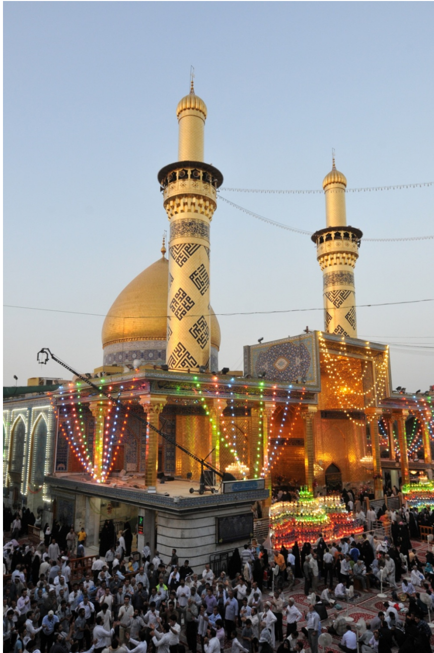
Imam al-Abbas عليه السلام , brother of Imam al-Hussain عليه السلام , Kerbala, Iraq